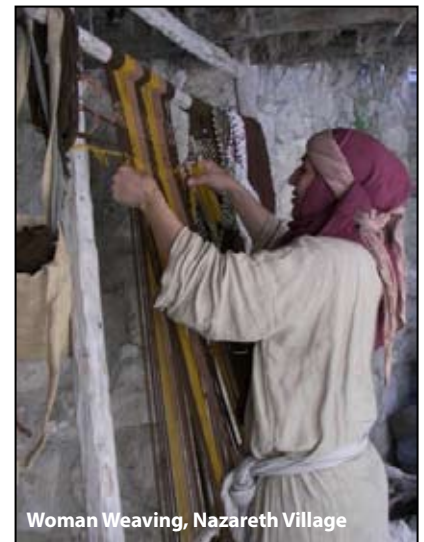
Woman Weaving, Nazareth Village