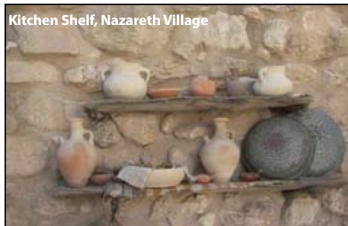
Kitchen Shelf, Nazareth Village