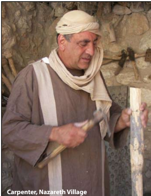
Carpenter, Nazareth Village

Supplemental cost of this optional GTD Travel Protection is $166 per person. Additional coverage provided as needed; the full cost of your tour must be covered. Travel protection is non-refundable fourteen days after you purchase a plan.